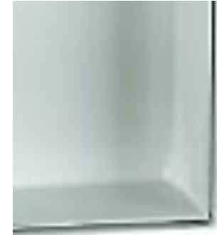
Recessed Door Accepts 1/2" Insert