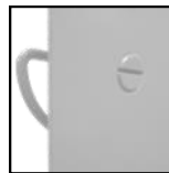
Standard Cam Latch